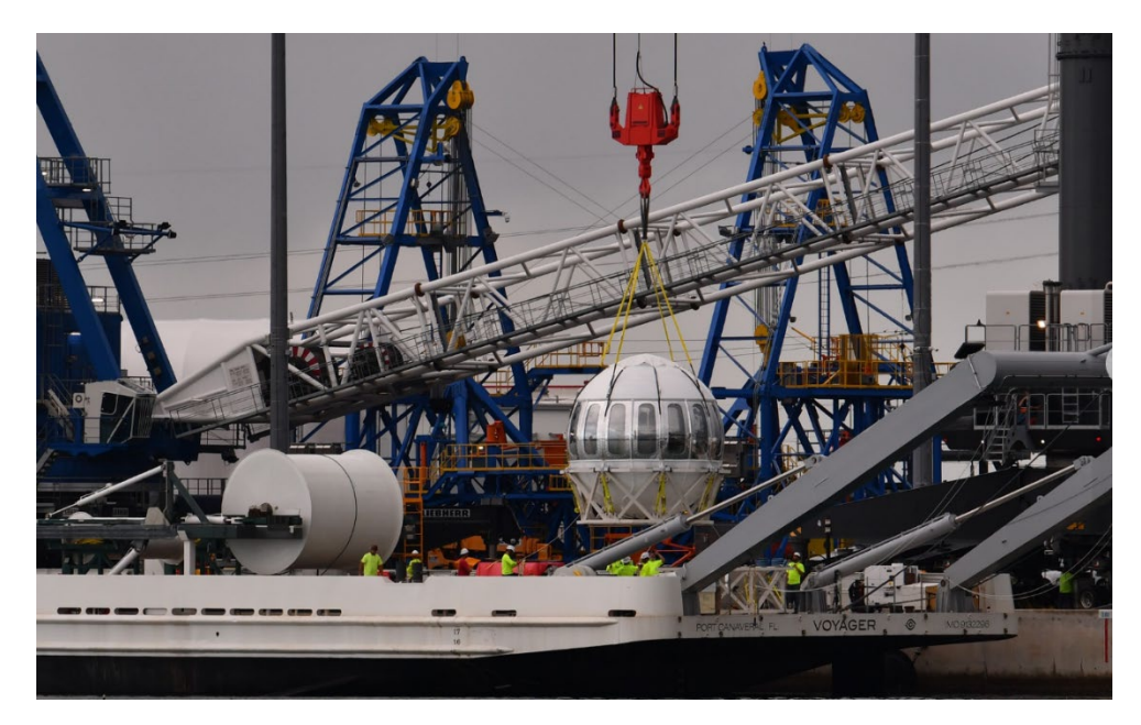
Pictured: Space Perspective's capsule, Spaceship Neptune , loading onto the MS Voyager at Port Canaveral's NCB 6, September 2024