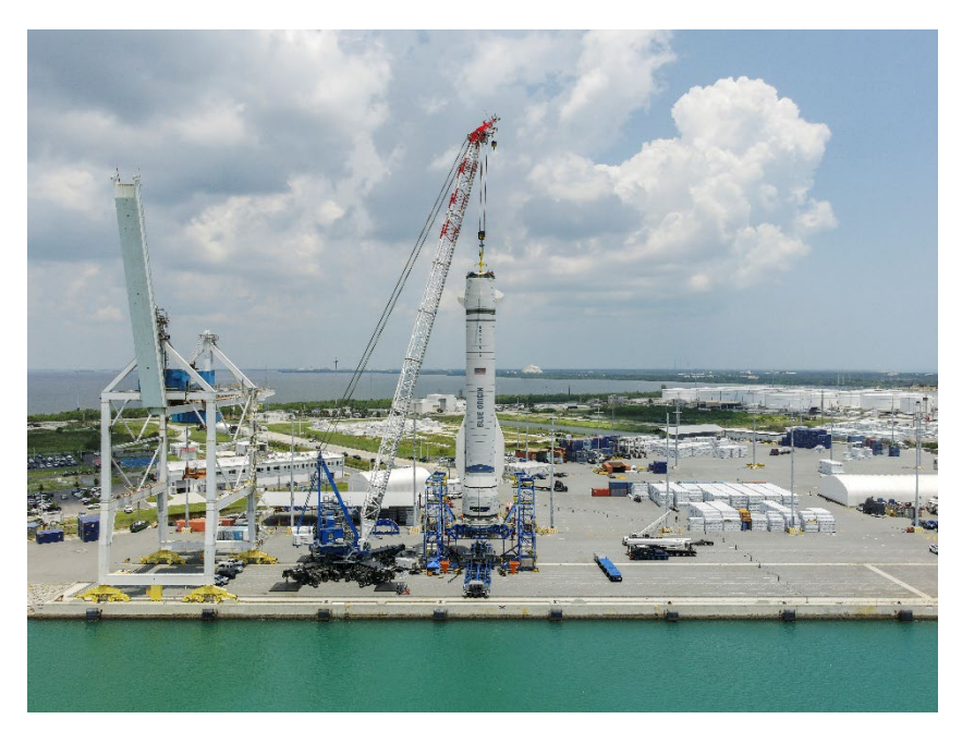
Pictured: Blue Origin's Transport Rehearsal of the New Glenn at Port Canaveral's NCB 6, August 2024

In August 2024, Blue Origin took a significant step forward in their operational capabilities with the New Glenn rocket booster. To ensure smooth and efficient booster recovery, Blue Origin showcased the essential process of transitioning New Glenn's first stage from its vertical (landing) position to horizontal (laydown) position using the company's 200-foot-tall simulator. Following this successful demonstration, Blue Origin proceeded with testing the logistics and transport processes involved in moving the booster from the Canaveral Cargo Terminal to S.R. 401 for its transport north to the company's facilities at Exploration Park. This transport "rehearsal" tested key elements including coordination with the Port's public safety and operations personnel, cargo tenants, and Brevard County Sheriff's Office to ensure safe and successful movement of the oversized load through the Port and onto the state highway.