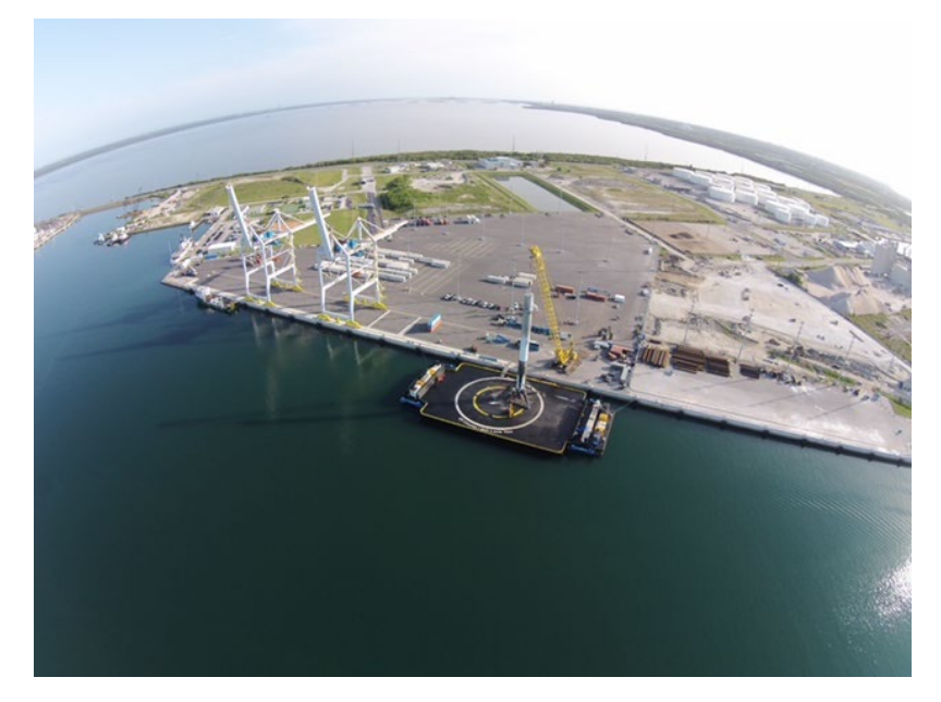
Pictured: First successfully recovered SpaceX Falcon 9 Booster arrives at Port Canaveral's NCB 6, April 2016

On April 8, 2016, a few short months after initial discussions commenced, SpaceX made history with the successful landing of a Falcon 9 booster on their autonomous drone ship Of Course I Still Love You . This operational success, followed by the rocket booster's transport to the Port for offloading, showcased the feasibility of integrating aerospace operations into a commercial maritime environment. The booster was then offloaded at NCB 6, a location that would become central to SpaceX's recovery operations.