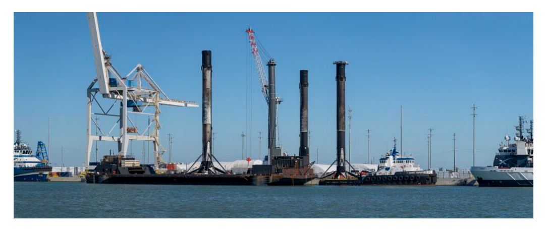
Pictured: 3 SpaceX Boosters at the Canaveral Cargo Terminal, December 2024

With guidance and assistance from Port Canaveral, SpaceX has demonstrated their ability to adapt and innovate their recovery operations in a commercial seaport environment. While the company's method for managing recovered launch components differs significantly from "traditional" seaborn cargo operations, they have incorporated specialized handling equipment and executed precise maneuvers to manage large, intricate components. The company has shown a commitment to continuous improvement resulting in an impressive reduction in offload times. By optimizing their processes, SpaceX has successfully cut offload times by more than 50%.