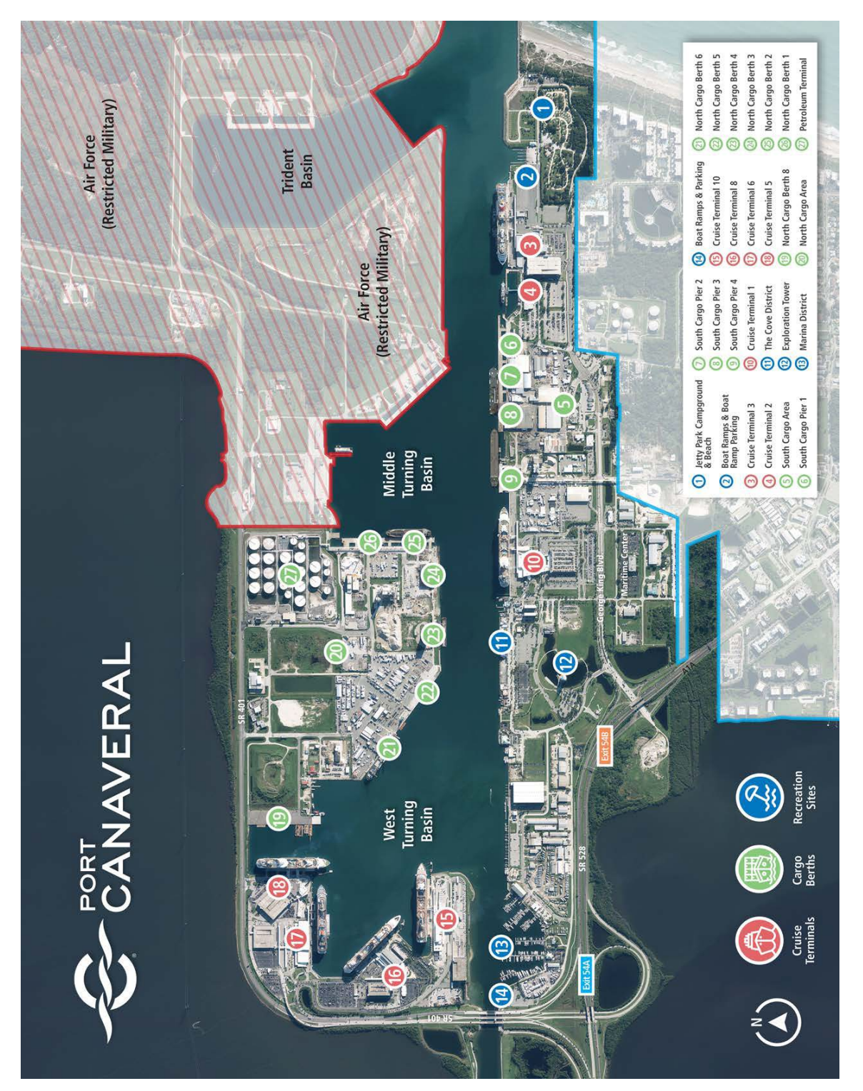
Overall Port Facilities Map