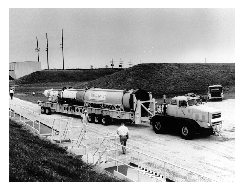
Pictured: The First Minuteman II Missile in Port Canaveral, 1964

As America's space program evolved, Port Canaveral's strategic location took on an invaluable role in the transportation process for rocket hardware designed and built for launches between 1960 and 2011. The Canaveral Locks, operated by the U.S. Army Corps of Engineers and completed in 1965, were re-engineered at NASA's request to accommodate the transport of the Saturn V rocket stages for the Apollo moon program and other launch vehicles in development. With this strategic improvement in place, the Port and the Canaveral Locks continued to support the transport of Space Shuttle rocket boosters from 1980 until the program's conclusion in 2011.